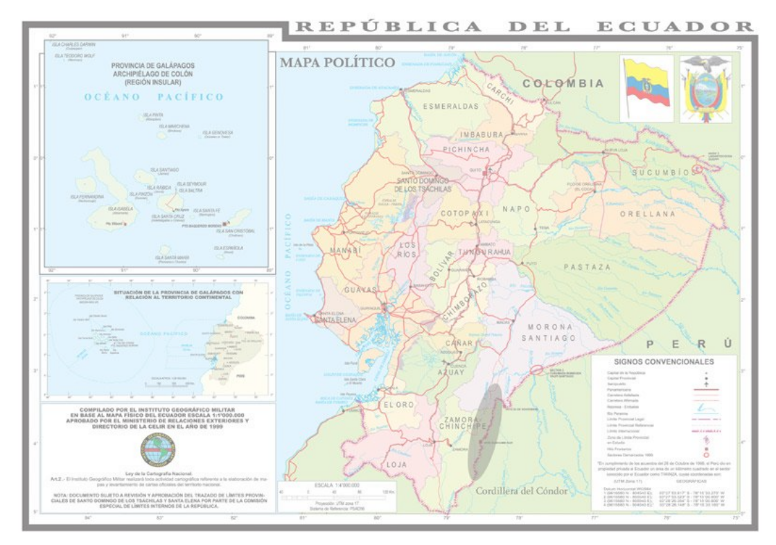
Fig 1. Political map of Ecuador showing the area of the Cordillera del Cóndor<sup>2</sup>.

The Cordillera is located in the cantons of Limon Indanza and San Juan Bosco, running south to Gualaquiza in Morona Santiago. It then continues into the province of Zamora Chinchipe in the cantons of El Pangui, Yantzaza, Centinella del Cóndor and Nangartiza. Zamora Chinchipe province covers an area of 20,681 km2 with a population of 76,601 (0.56% of the national population)<sup>3</sup>. The provinces and cantons of the southern Ecuadorian Amazon are relatively recent. El Pangui and Yantzaza were recognised as independent cantons just a little over 20 years ago. Zamora-Chinchipe has a very varied geography due to the influence of the Eastern and Cóndor highland areas and is situated at the confluence of the Zamora and Bombuscara rivers. Podocarpus National Park (PNP) is located in the south-western part of the province. This cloud forest stretches west to east from the city of Loja to Zamora. Its 146,200 hectares are home to many rivers, over 100 lakes and various species of bird. Elevations in the park range from 1,000 to 3,000 meters with temperatures varying from 8 to 20 degrees centigrade.