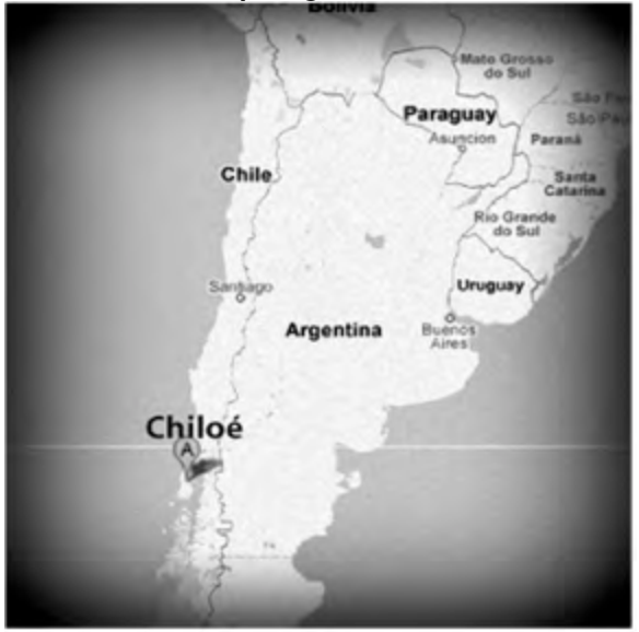
Map 1. Archipelago of Chiloé

Contradictory dynamics of development coexist in Chiloe (Type 2 Territory, according to Typologies of territorial dynamics in relation to cultural identity dynamics - Ranaboldo y Schejtman, Eds, 2009)<sup>1</sup>.