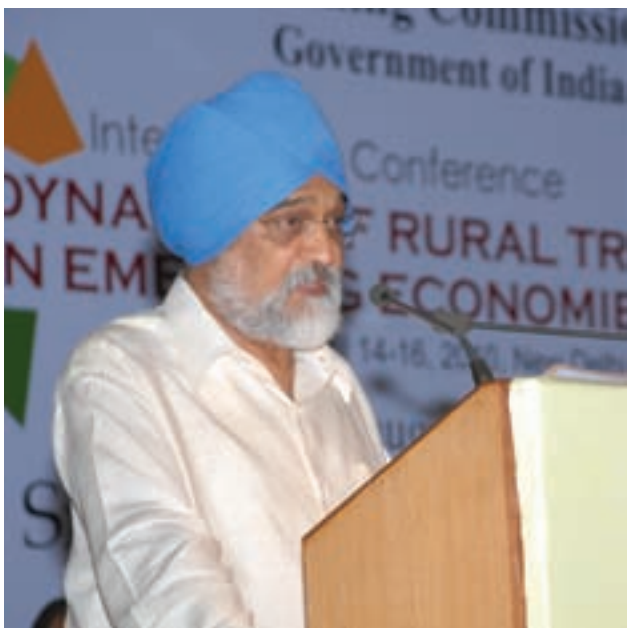
Montek Singh Ahluwalia, Deputy Chairman, Planning Commission, Government of India