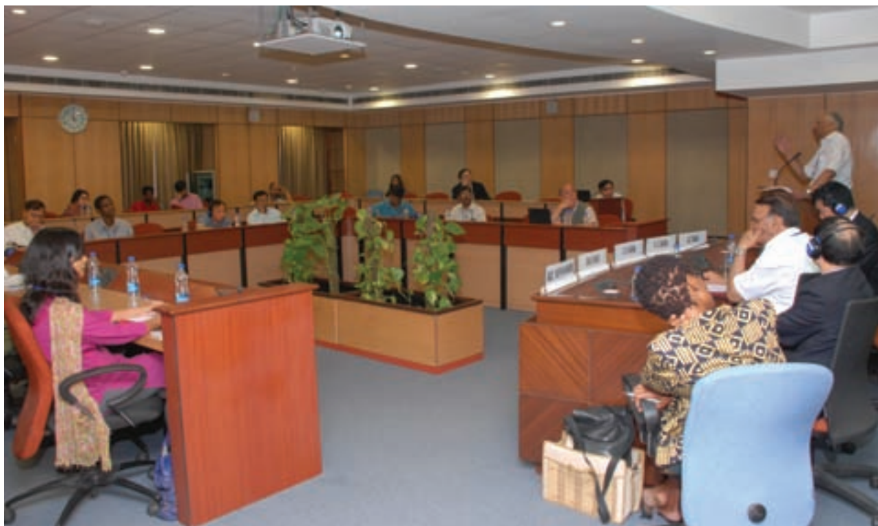
Parallel working group sessions enabled detailed sharing of innovations and practice

adaptation in the context of, for example, adaptation to climate change through the maintenance of biodiversity, needs to be recognized and understood.