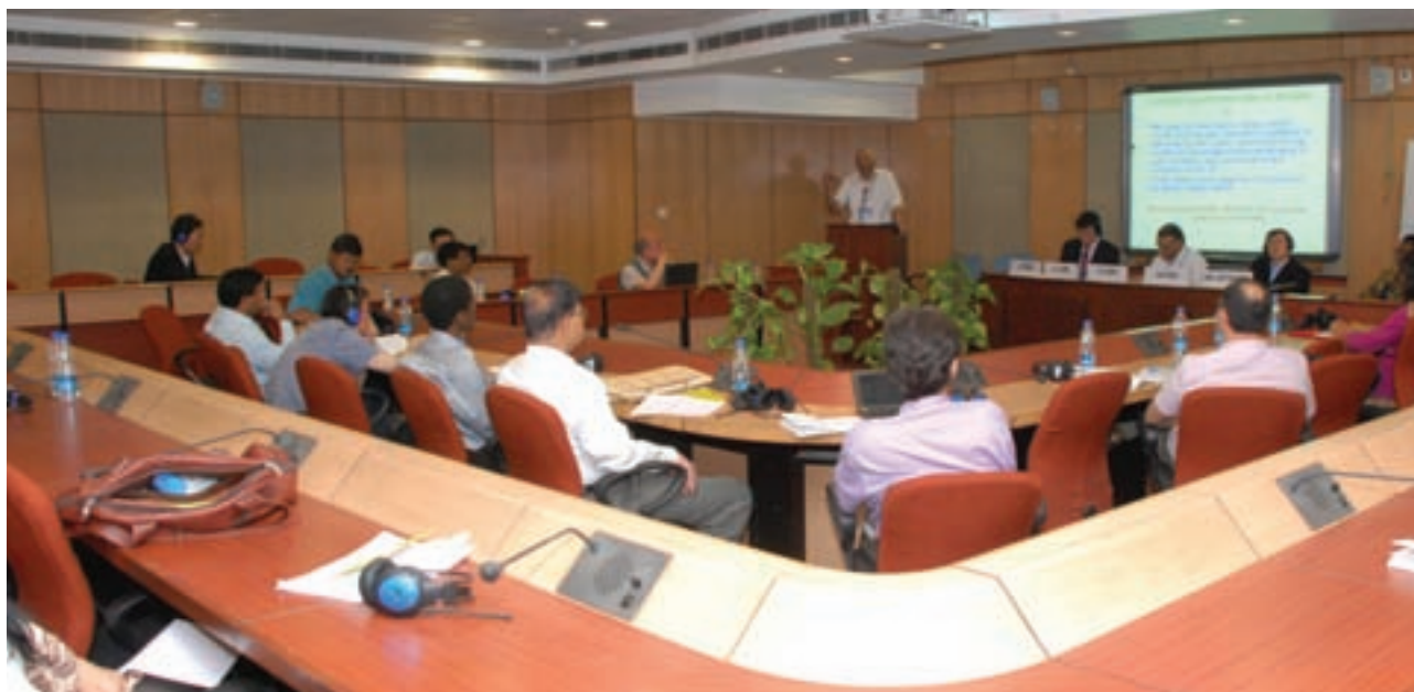
One of the parallel working group sessions

In the case of China, there was interest in how village councils come into existence. It was noted that these are largely a result of ‘bottom-up democracy’. Village-level autonomy is ensured financially by making sure that each village council has adequate finances to support operational costs, including salaries.