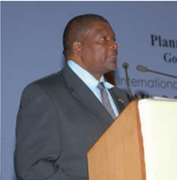
Minister Gugile Nkwinti, Department of Rural Development and Land Reform, Republic of South Africa