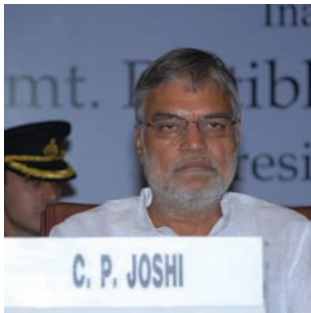
Minister C P Joshi, Minister for Rural Development and Panchayati Raj, Government of India

is considerable scope for strengthened understanding and learning, and to identify special initiatives for collaboration among emerging economies. These countries can and will contribute to a 'new economic order', given their trading position, and this will require change – noting that more is needed for faster change.