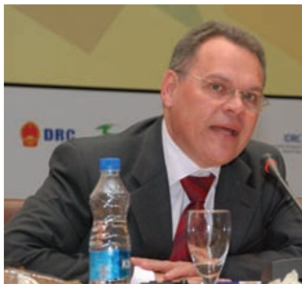
Minister Guilherme Cassel, Ministry of Agrarian Development, Brazil

Brazil has achieved remarkable progress in terms of poverty reduction, including strengthening family farms and increasing the number of family farm units, increasing the minimum wage and securing social inclusion of the rural poor through supportive public policies for rural development. In 2003, the Zero Hunger programme launched both emergency actions: Bolsa Família (Family Grant Program) and Benefício de Prestação Continuada da Assistência Social (BPC-LOAS, Brazilian Social Assistance Pension – Article of the Social Assistance Act), as well as structural actions, including land reform, support to family farming, and job and income generation. Minister Cassel reported that the first generation agrarian reform (2003–2009) has therefore achieved success in terms of land distribution, access to rural credit and technical assistance.