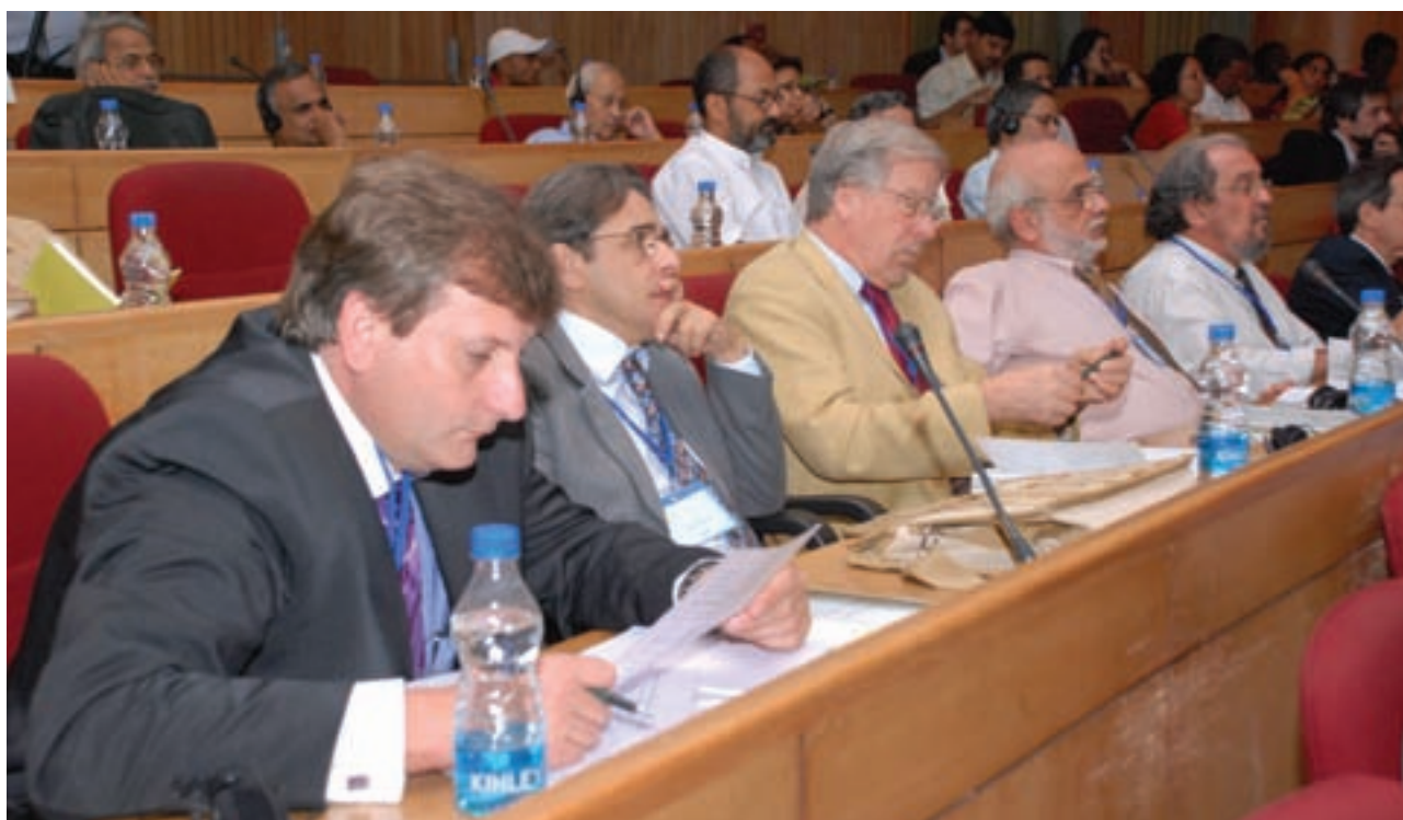
Members of the conference delegation from Brazil

and towards expenditures on public goods like agricultural research and rural roads (e.g. in India), supporting smallholders and family farms in less-favoured areas, policies to reduce rural–urban disparities (e.g. fiscal stimulus focusing on rural areas), and further reforms in land and land-use ownership (e.g. China).